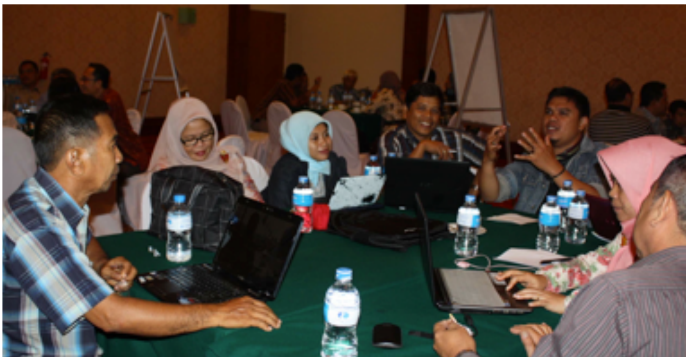
Program staff from six provinces and 24 districts sharing their input during the review of the implementation of the Nutrition Improvement for Community Empowerment (NICE) project.

Based on the reaction from the participants, the review and consultative workshop succeeded in positioning the project towards the achievement of the Project's objectives in 2012.