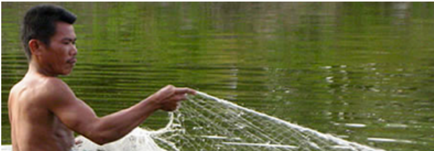
SEARCA's EU-FPAVAS project beneficiary casting nets during the initial harvesting of whiteleg shrimp ( Litopenaeus vannamei ) located in San Teodoro, Oriental Mindoro. A total of 660 kilos of Vannemei were harvested last 25 June 2011.